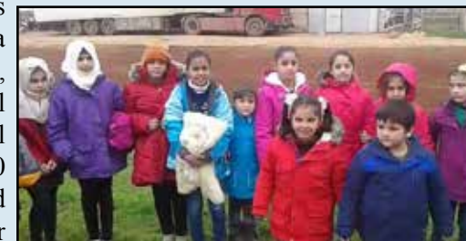
"Children in Syria received Land's End® winter coats from a recent shipment."

The impact of these relief goods in Syria is just one story of many coming through the warehouse. Over 30 containers were sent from New Holstein in 2018 totaling 800,000 lbs of goods.