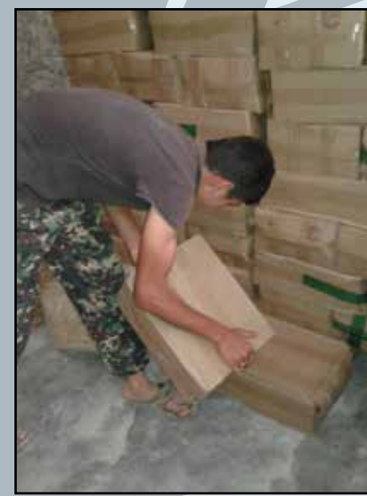
Success! Shipment to Syria arrived safely.